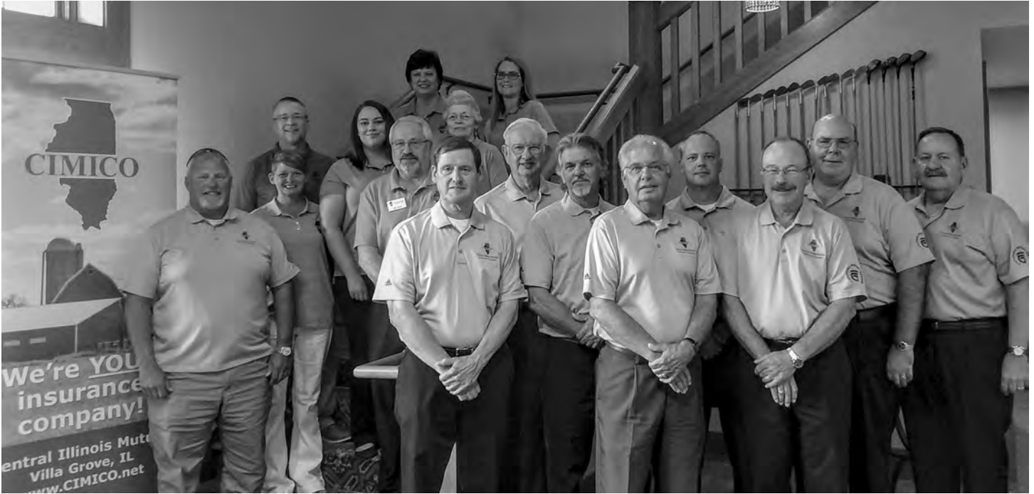
CIMCO Staff and Board of Directors