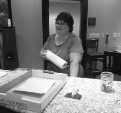
From registration to the conclusion of Convention, IAMIC members were on a not-so-secret mission to “Get Smart” and acquire new knowledge from faculty and peers.