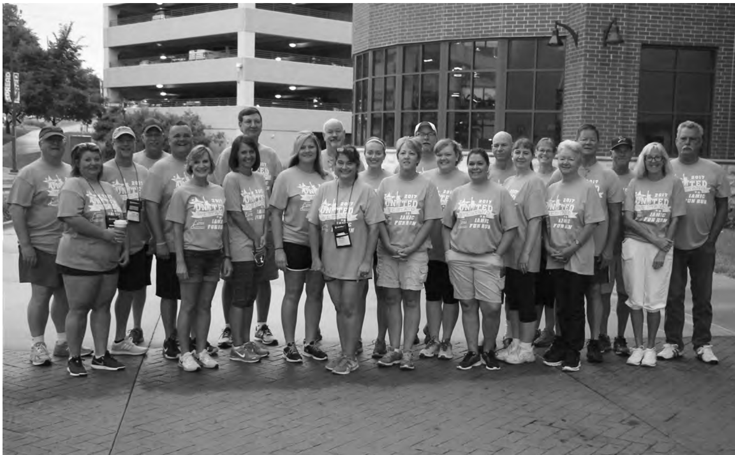
This years fundraiser was for the Central Illinois Agency on Aging. We are proud to report that IAMIC members donated $1,626 — GREAT JOB!