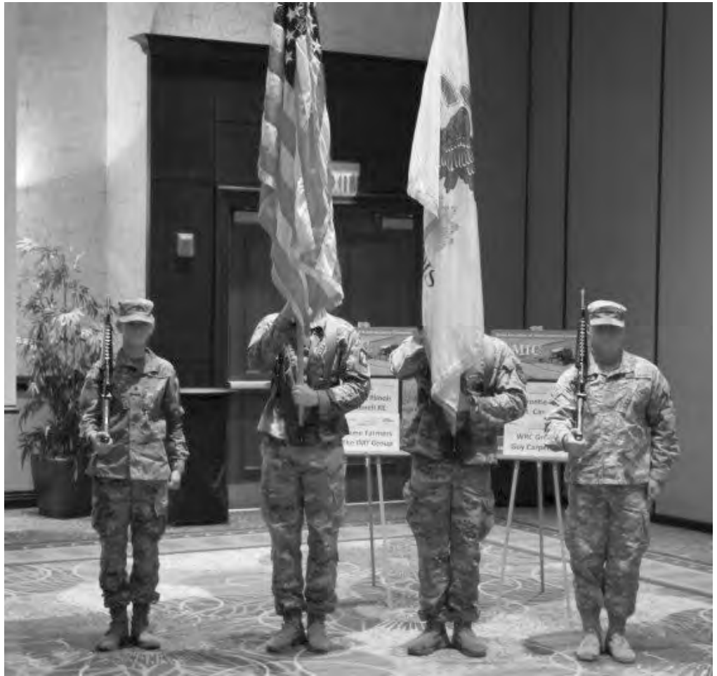
We had the honor of having the ROTC Cadets from ISU present colors during our opening ceremony.