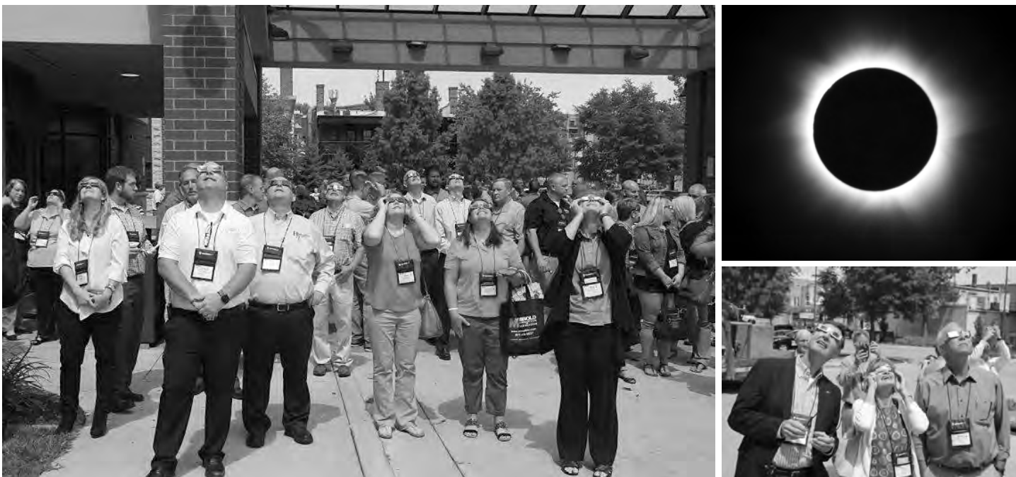
Things were really looking up when the 2017 Convention and Trade Show conveniently coincided with The Great American Eclipse on August 21st! IAMIC provided protective eyewear to all attendees, and near the time of totality we took a break to go outside and view this historic and remarkable event. ( Yes, we all got “mooned” and loved every minute of it! )