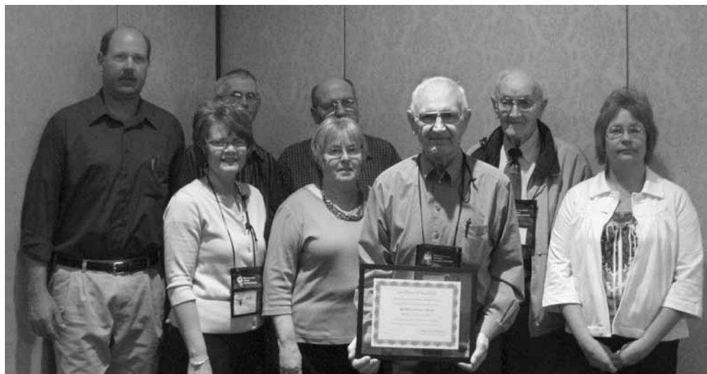
Sigel Mutual — 125 Years