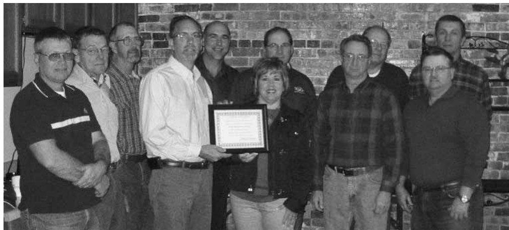
Elmira Mutual — 135 Years