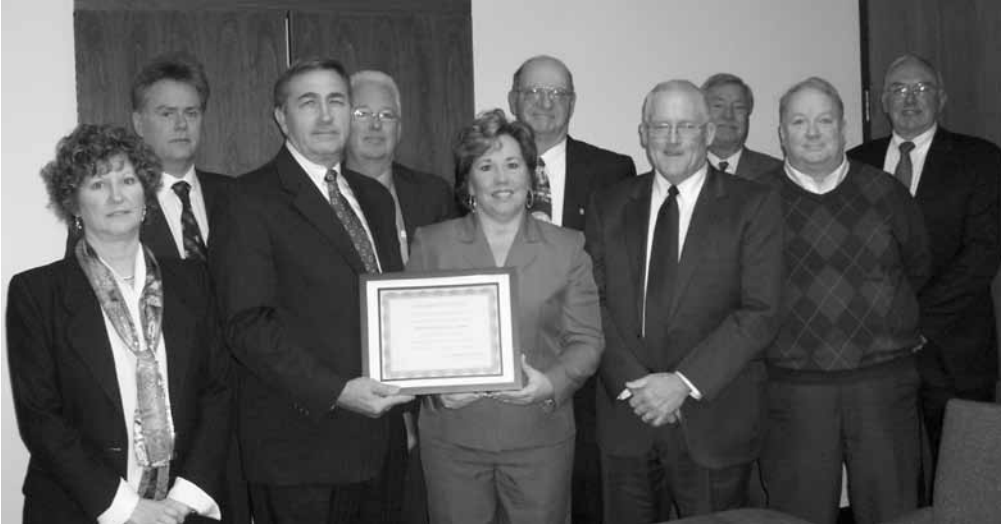
Rockford Mutual — 115 Years

If your Mutual is celebrating a five year milestone in 2012 watch for a request from the IAMIC office to attend one of your board meetings to present your company with an Anniversary Plaque!