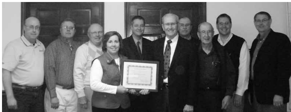
Frontier Mutual — 125 Years