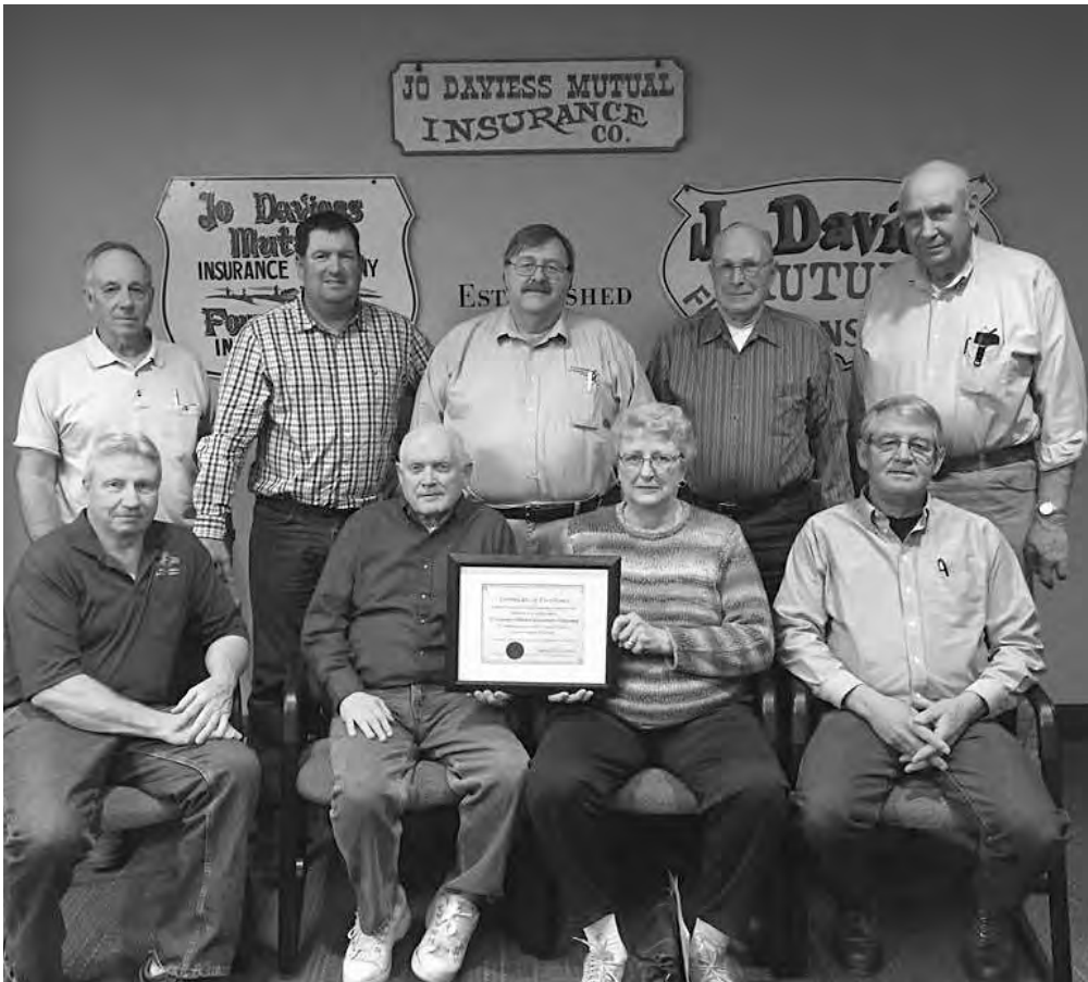
Jo Daviess Mutual Board of Directors