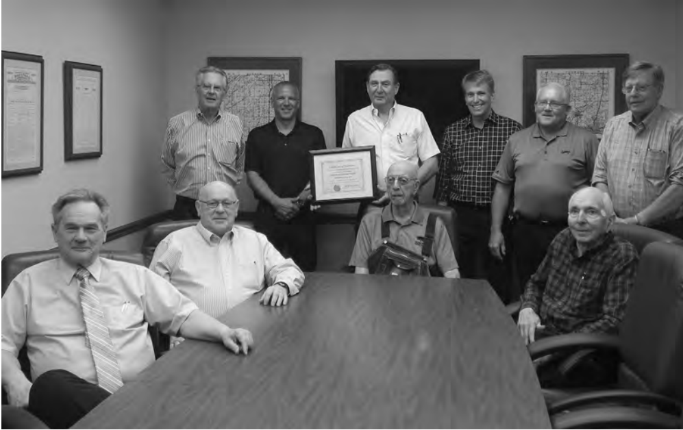
Dunham & Chemung Mutual Board of Directors

(Mutual Milestones – continued from page 14)