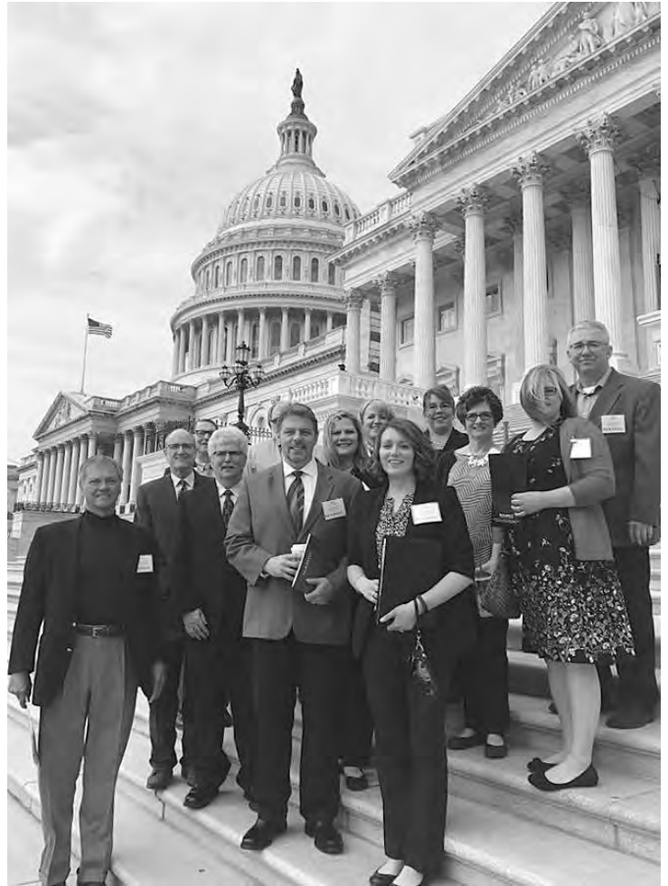
Above right photo: THANK YOU TO OUR CCP PARTICIPANTS!