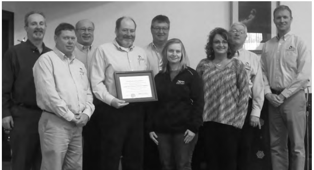
Right: Camp Point Mutual Board of Directors