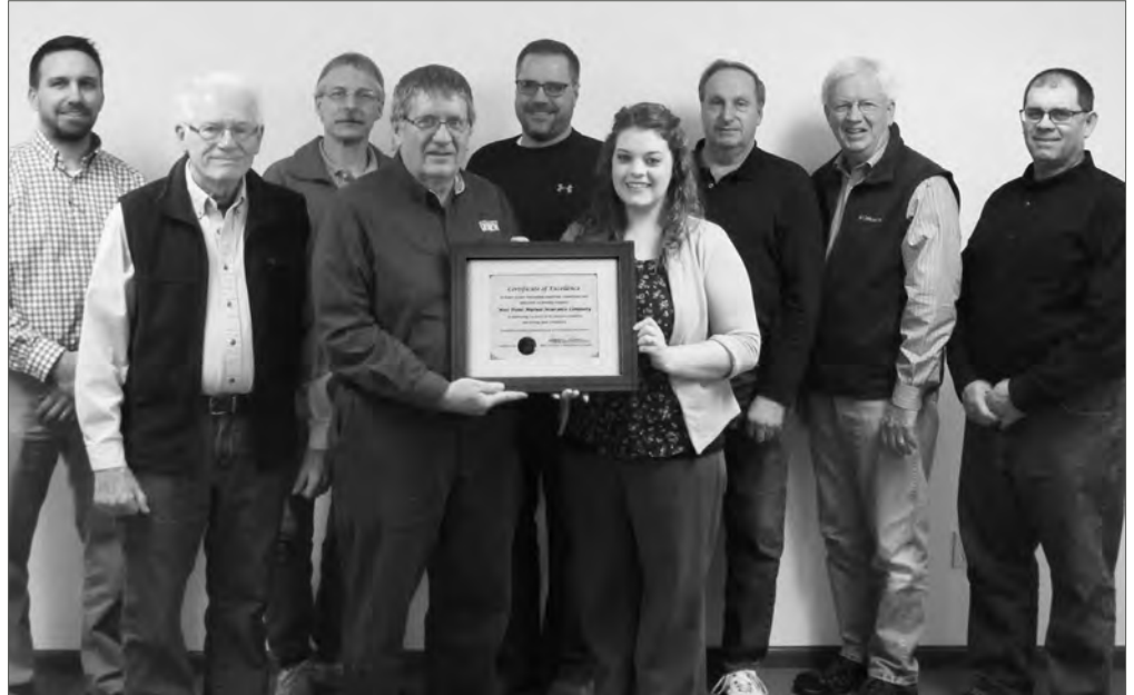
Right: West Point Mutual Board of Directors