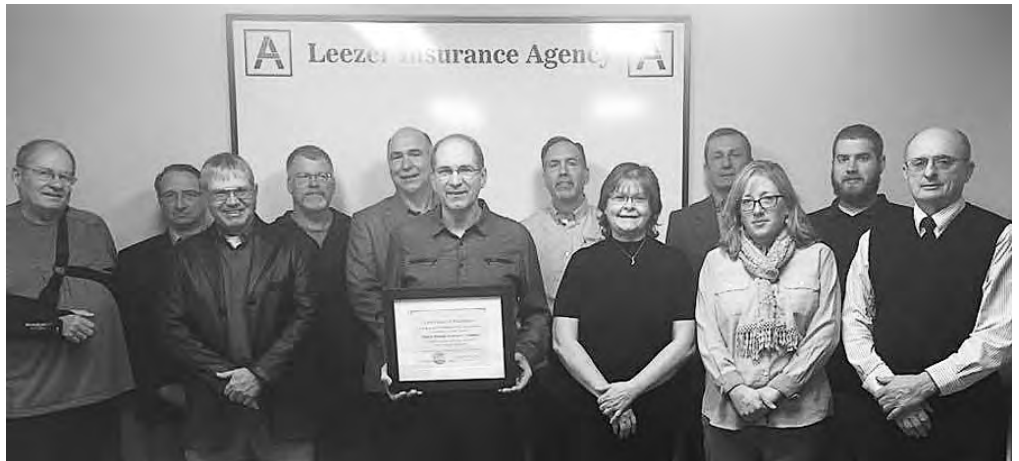
Elmira Mutual Board of Directors