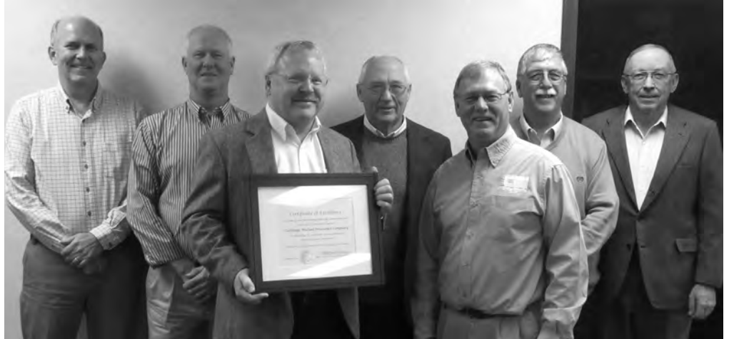
Carthage Mutual Board of Directors